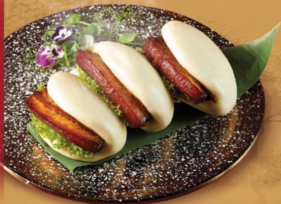
Signature Braised Kou Rou Pau (Pork)