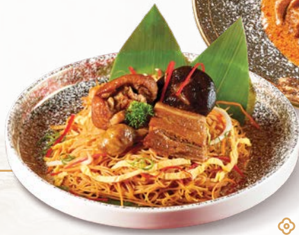
招牌咖哩鸡 Signature Curry Chicken

$28.99 per person w/GST $31.31 Min. 30 pax | 9 Dishes Limited to 1 dish per Category