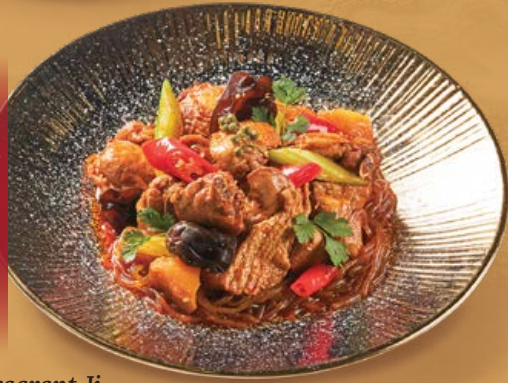
Signature Fragrant Ji Gong Bao