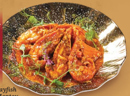
Chilli Crayfish w Fried Mantou