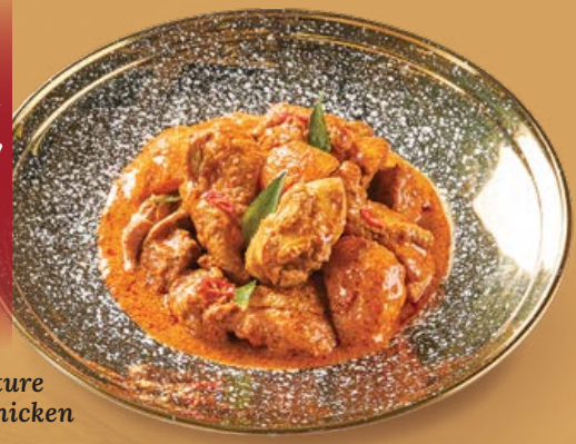
Signature Curry Chicken