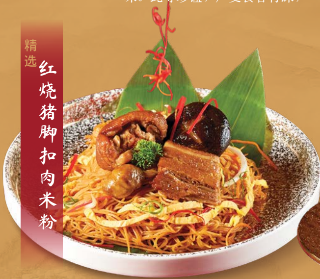
Signature Braised Pork Trotter Vermicelli