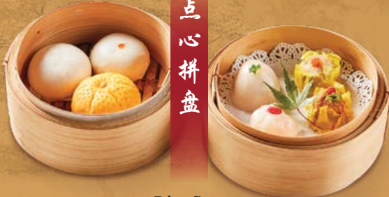
Dim Sum Platter