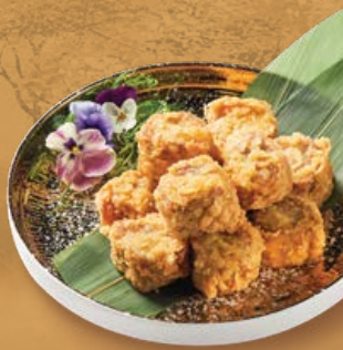
Signature Deep-Fried Hei Zho (Prawn Roll)