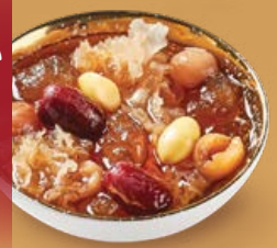
Beauty Peach Gum Cheng Tng