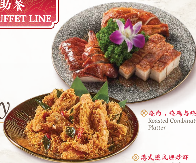
烧肉, 烧鸡与烧鸭 Roasted Combination Platter

$35.99 per person w/GST $39.23 Min. 30 pax | 10 Dishes Limited to 1 dish per Category