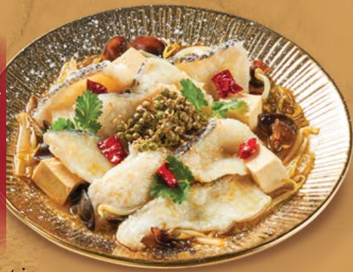
Fish Fillet in Sauerkraut Sauce