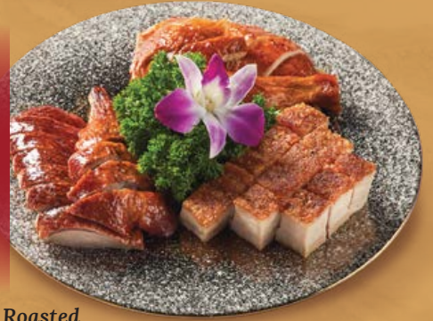
Hong Kong Roasted Combination Platter