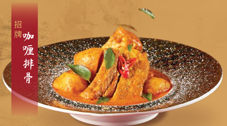
Signature Curry Pork Ribs