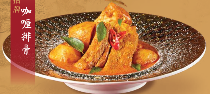
Signature Curry Pork Ribs