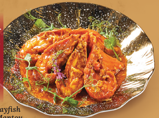
Chilli Crayfish w Fried Mantou