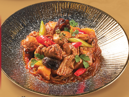
Signature Fragrant Ji Gong Bao