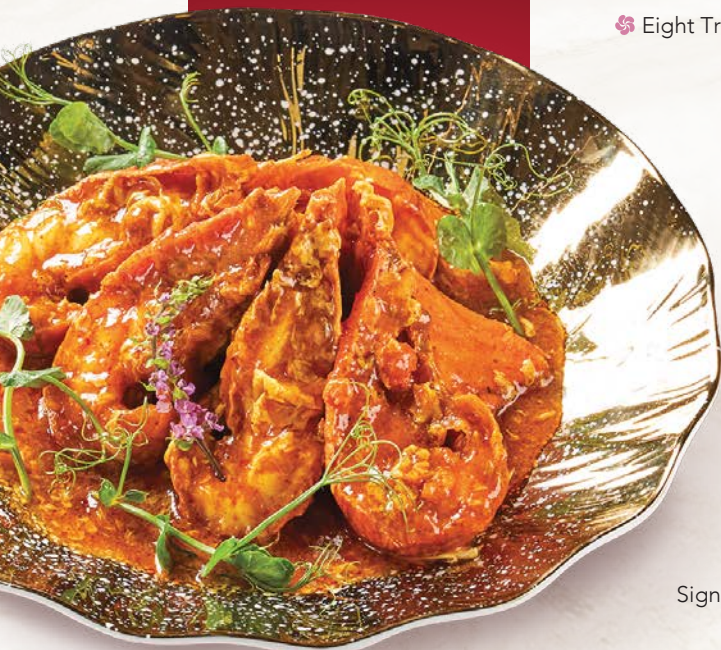
🌶️ 辣椒虾婆 Chilli Crayfish

per person w/GST $64.30 Min. 30 pax | 13 Dishes Limited to 1 dish per Category