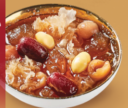
Beauty Peach Gum Cheng Tng