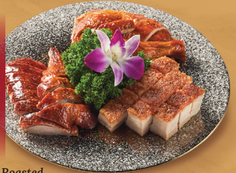
Hong Kong Roasted Combination Platter