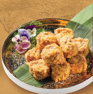
Signature Deep-Fried Hei Zho (Prawn Roll)