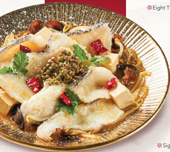
川味酸菜鱼片 Fish Fillet in Sauerkraut Sauce

per person w/GST $50.13 Min. 30 pax | 13 Dishes Limited to 1 dish per Category