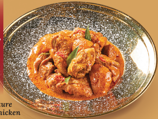
Signature Curry Chicken