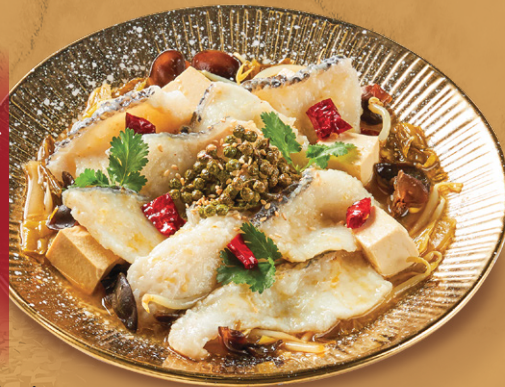
Fish Fillet in Sauerkraut Sauce