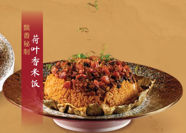
Fragrance Jasmine Rice in Lotus Leaf