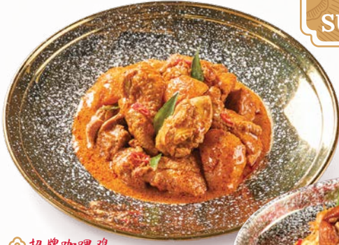
招牌咖哩鸡 Signature Curry Chicken