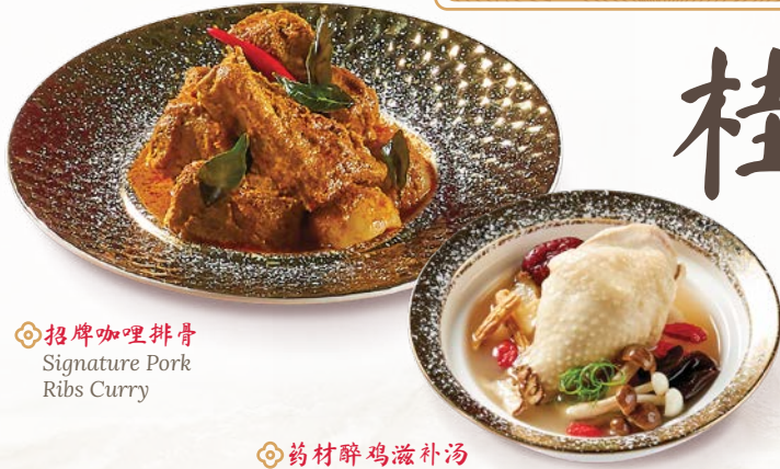
招牌咖喱排骨 Signature Pork Ribs Curry