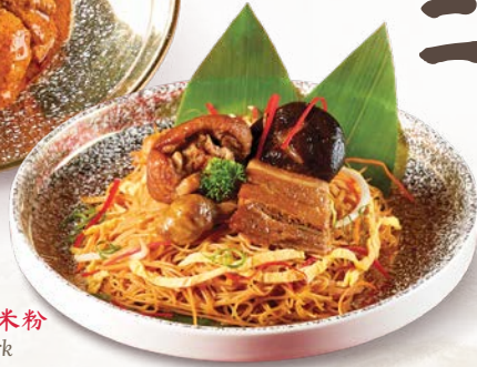
精选红烧猪脚扣肉米粉 Signature Braised Pork Trotter Vermicelli