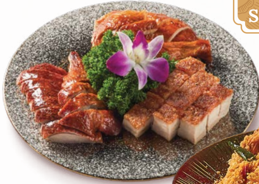
🍷 烧肉, 烧鸡与烧鸭 Roasted Combination Platter