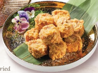
🍷 招牌鲜虾枣 Signature Deep-Fried Hei Zho (Prawn Roll)