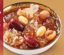
Beauty Peach Gum Cheng Tng