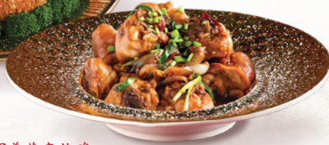
砂锅姜葱麻油鸡 Claypot Ginger Sesame Oil Chicken