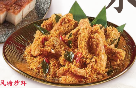
🍷 港式避风塘炒虾 Hong Kong Style Bi Feng Tang Prawn