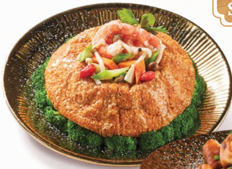
特制豆腐烩西兰花 Sautéed Premium Tofu w Broccoli