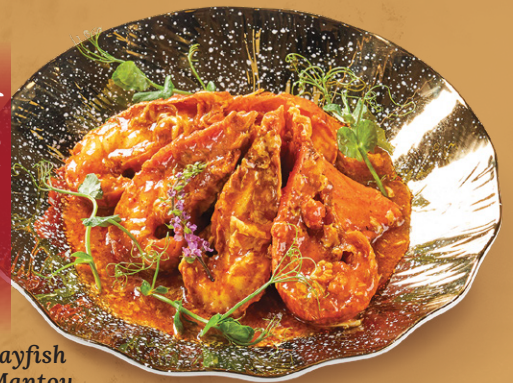
Chilli Crayfish w Fried Mantou