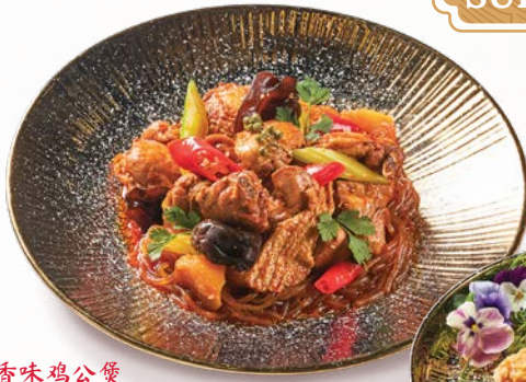
🍷 香味鸡公煲 Signature Fragrant Ji Gong Bao